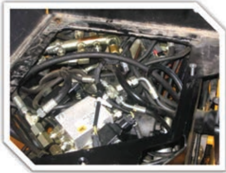
Before 60 minutes