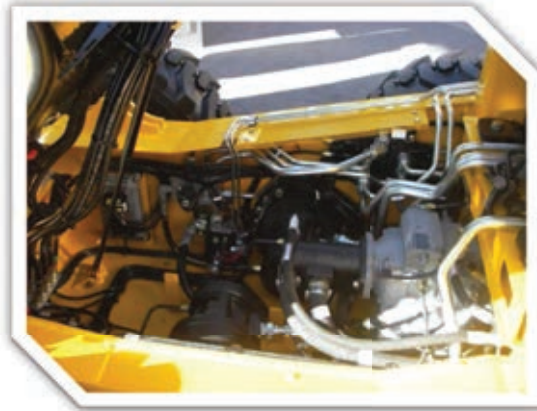
After 15 minutes